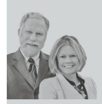
DIRECT FROM THE DIRECTORS