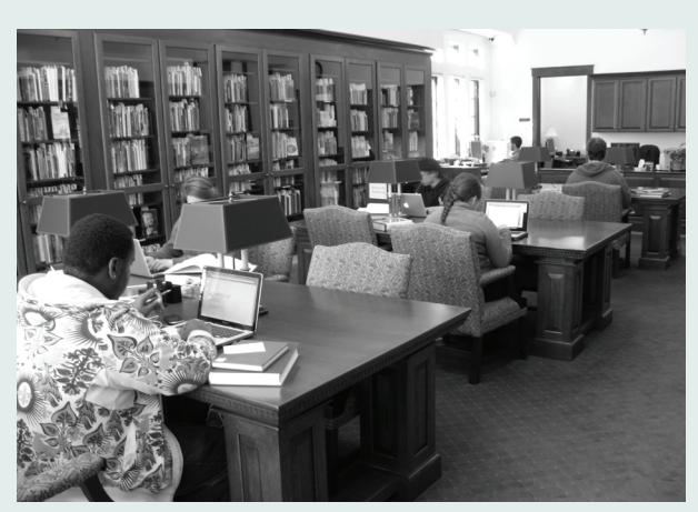
Wheaton College students using the resources of the Kilby Reading Room.

A majority of these visits were by students doing research for an English class who required the assistance of the Reading Room staff. One student recently