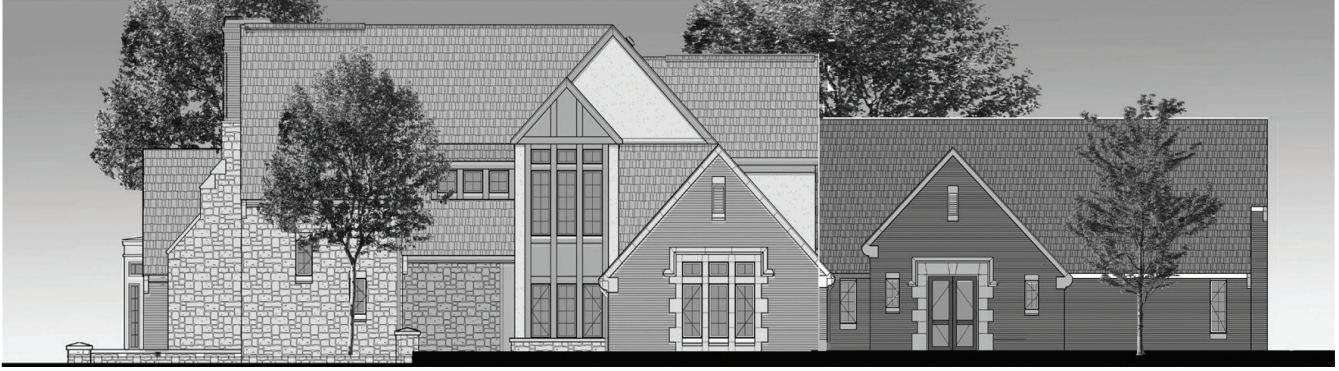
Exterior plans for the Bakke Auditorium, facing the building from the east. The addition is depicted in a darker shade here to distinguish it, but in its construction it will be consistent in color and building material with the existing Wade facility.

Since 2001, when the Wade's building was completed, Saturday morning reading groups, school field trip visits, college classes, and public lectures have taken place largely in the Wade's classroom, which can accommodate about 50 people. In recent years, some Wade events have been so popular that overflow attendees have had to sit in the entrance hall to the building, or the event has needed to be held in a different Wheaton College campus facility. The good news is that this growth in events and audiences indicates that these authors' writings continue to gain admirers and affect lives. But when a Wade event is held in a separate building, visitors aren't exposed to the extensive resources of the Wade itself, and the opportunity is missed to make a connection between a speaker's subject matter and the immediate availability of that material.