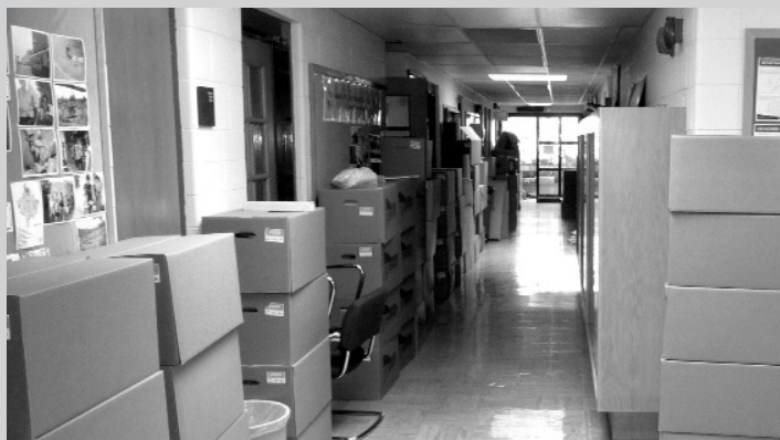
Third floor Breyer Hallway, filled with boxes.