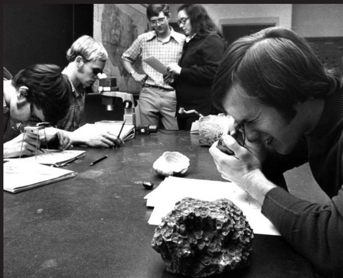
Geology majors in the late 70's