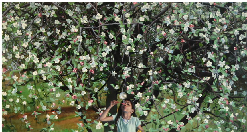
Holy, Holy, Holy, 2006