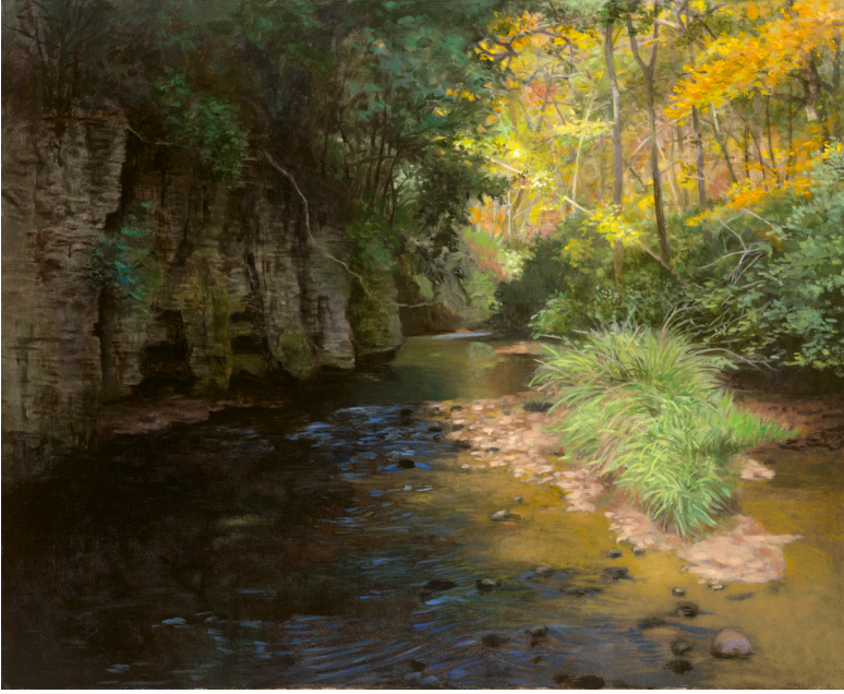
Dolomitic Outcropping Mill Creek, Oct. 24, 2016