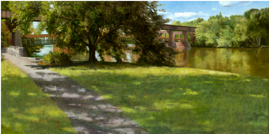
Fox River, Island Park Geneva, Sept. 2, 2016