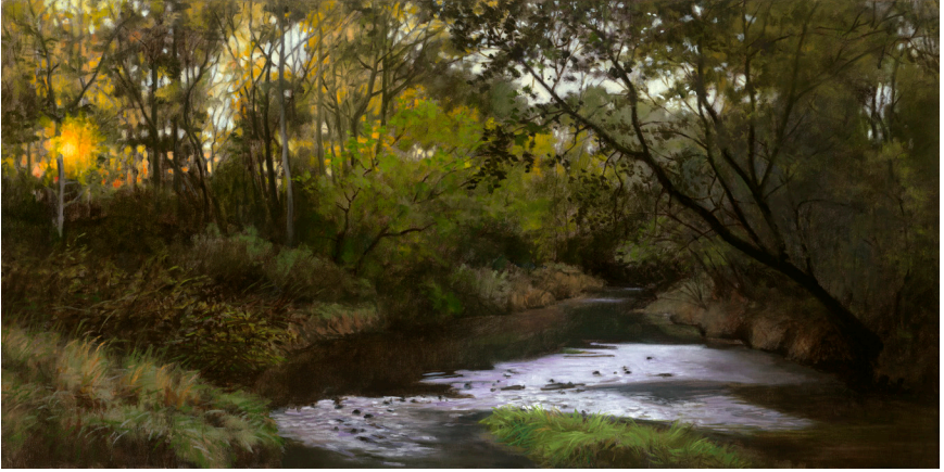
Ferson Creek Sunrise, Oct. 13, 2016