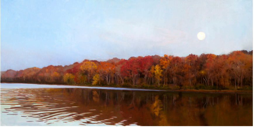
Moonrise Fox River, Nov. 12, 2016