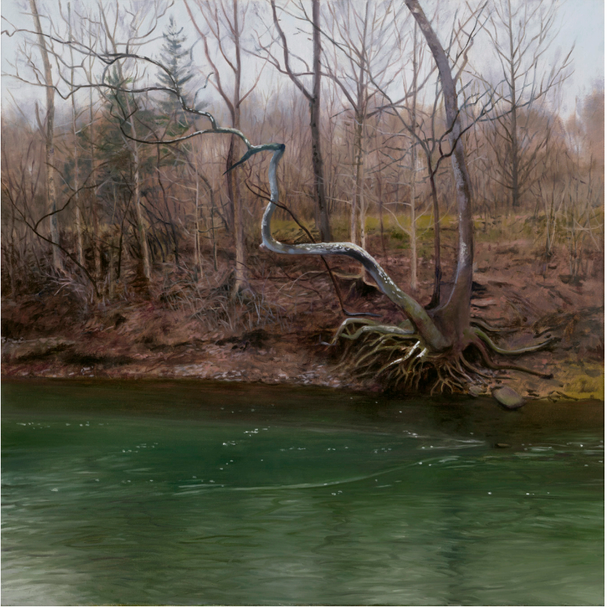
Sycamore on Big Rock Creek, 2017