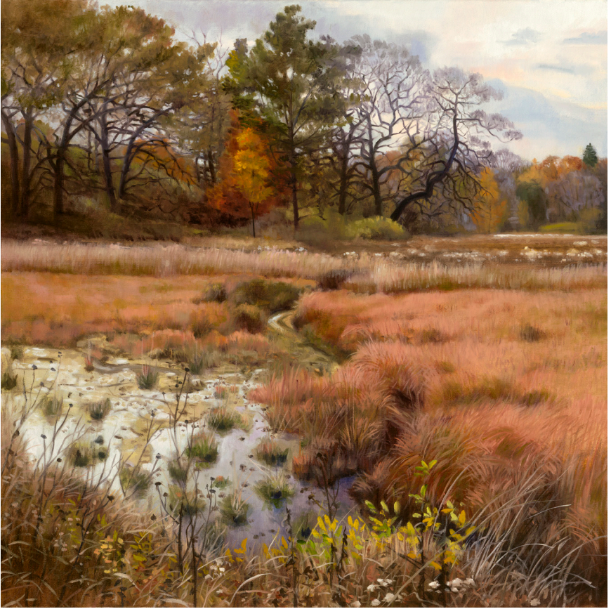
Bluff Spring Fen, Oct. 31, 2016