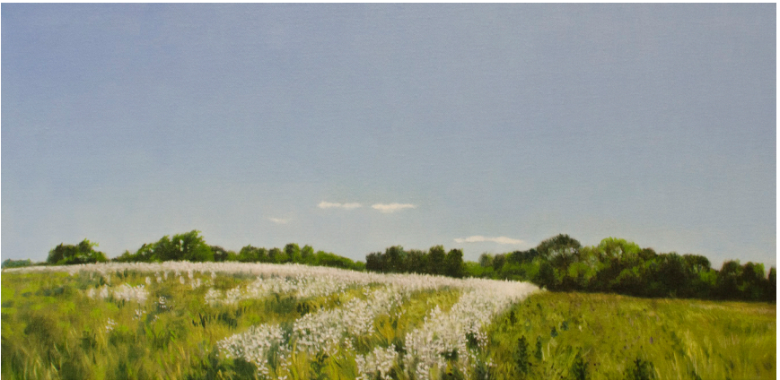
Fox Glove in Bloom Dayton Bluffs, June 6, 2017