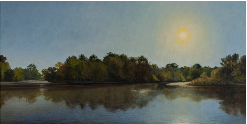
Fox River at South End Park, West Dundee, September, 2016