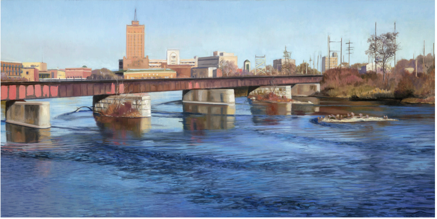
North Ave. Bridge, Aurora Nov. 29, 2016