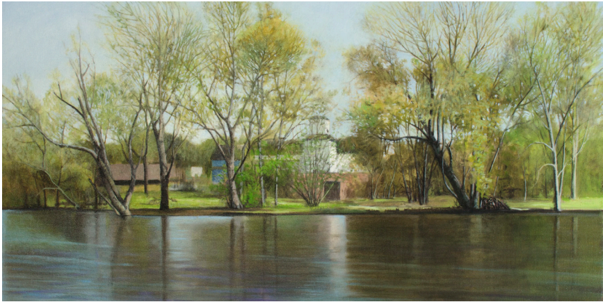
Oswego Grain Elevator on the Fox, April 17, 2017